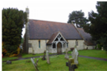
Places of Worship

In History this term, we have been exploring how travel and transport have changed over time. From horse drawn carriages to steam trains, bicycles and aeroplanes. The children have enjoyed comparing the ways people used to travel with how we get around today. They have loved learning about key inventions