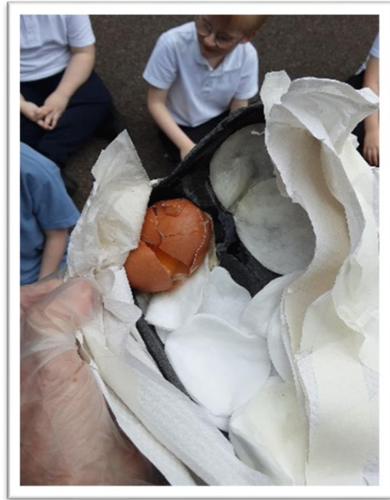
Egg when we dropped it!