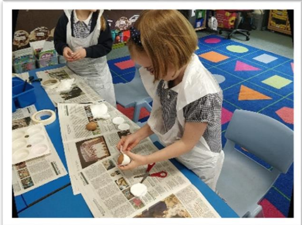
Wrapping our eggs