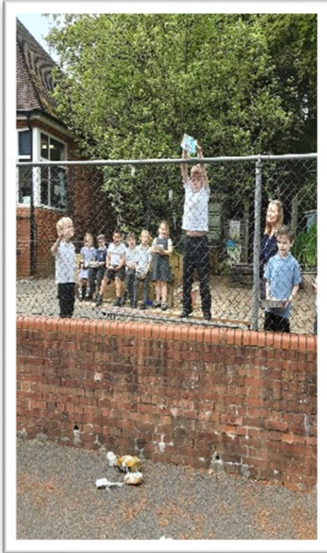
Dropping our eggs