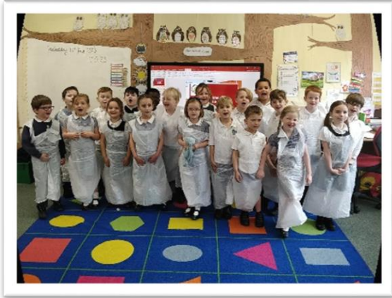
Super Class 2 Scientists